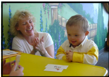
Children learn to read while building self esteem and having fun every week!!