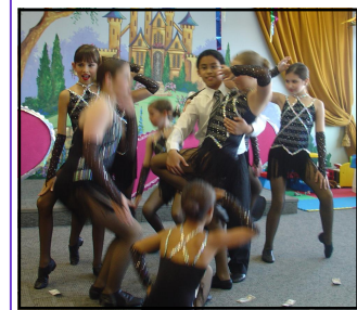
Center Stage Dance Studio in Bloomingdale gave an awesome performance at the Playhouse!