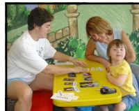
Expanded our program with the help of our volunteers.