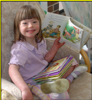
All proceeds benefit the GiGi's Playhouse Free "Learn to Read" Literacy Program.

Be a part of the best finish line in town!