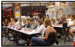
Worked with teachers and therapists to help them teach kids with DS to read.