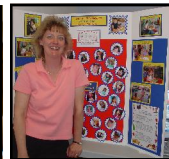
Spoke about the program at National conferences

Please participate in the GiGi's Playhouse 5k Fun Run 1 Mile Walk to not only raise awareness about Down syndrome but raise funds for this awesome program as well!!