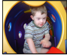
The Saturday afternoon tumbling class. Helps build strength, endurance, self esteem and it's fun!!